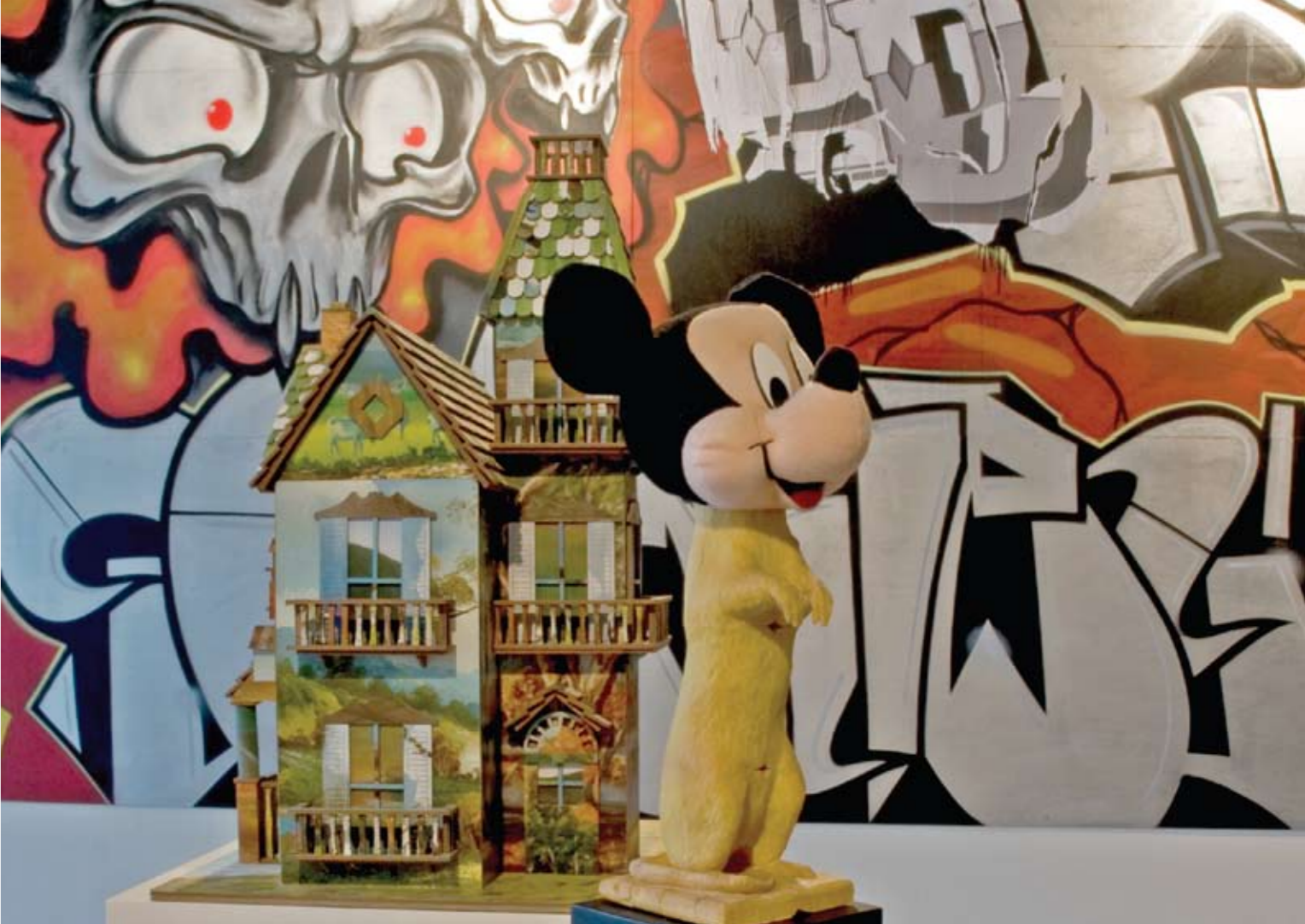
All images, SILVER: ARTRAGE 25 , installation views, PICA 2008